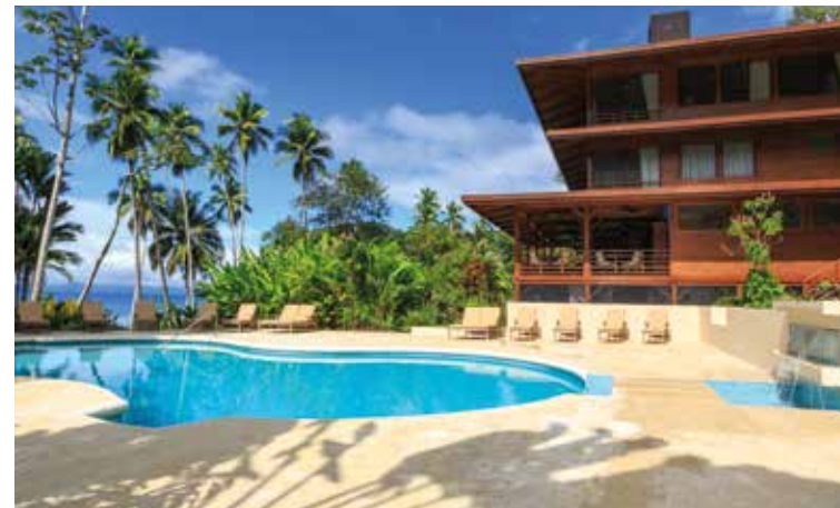
Playa Cativo Piedras Blancas National Park FB

Reaching this lodge by raft is all part of the experience! Each of the bungalows have a private terrace, en-suite facilities and views to the lush garden or the river. There is a bar and restaurant. Excursions (payable locally) include a canopy tour through the rainforest, horse riding, hike to a Cabecar Indian community. A unique and special place.