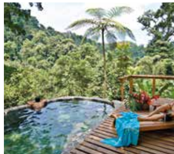
Pacuare Jungle Lodge Pacuare River FB

This smart estancia has ten rooms which feature shower, air conditioning, complimentary wifi, flat screen TV, coffee maker and safe deposit box. Junior suites have balconies. Facilities include a bar, dining room, pool and living room. Guests can explore the area on a boat or jeep safari to view the impressive wildlife. A special wildlife safari in a tranquil environment.