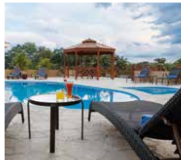
Rancho Humo estancia Tempisque River (Puerto Humo) FB

This smart estancia has ten rooms which feature shower, air conditioning, complimentary wifi, flat screen TV, coffee maker and safe deposit box. Junior suites have balconies. Facilities include a bar, dining room, pool and living room. Guests can explore the area on a boat or jeep safari to view the impressive wildlife. A special wildlife safari in a tranquil environment.